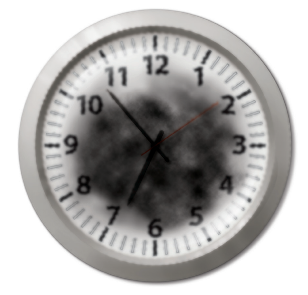
With AMD, dark areas may appear in your central vision.

AMD can affect one or both eyes. Your AMD may be so mild that you hardly notice any problems. Or your AMD may be more severe. With severe AMD, you may notice that printed words and even straight lines look wavy or blurry. You may also notice what seems to be a dark or empty space in the center of your vision. For example, you may see the outline of a clock but not see the hands to tell what time it is.