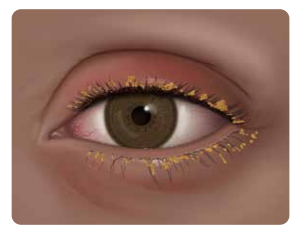
With some types of blepharitis, the eyelids become coated with oily particles and bacteria near the base of the eyelashes.

Blepharitis is inflammation of the eyelids. They may appear red, swollen, or feel like they are burning or sore. You may have flakes or oily particles (crusts) wrapped at the base of your eyelashes too. Blepharitis is very common, especially among people who have oily skin, dandruff or rosacea.