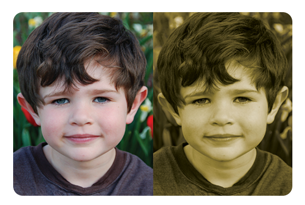
Left, normal vision. At right, dull or yellow vision.