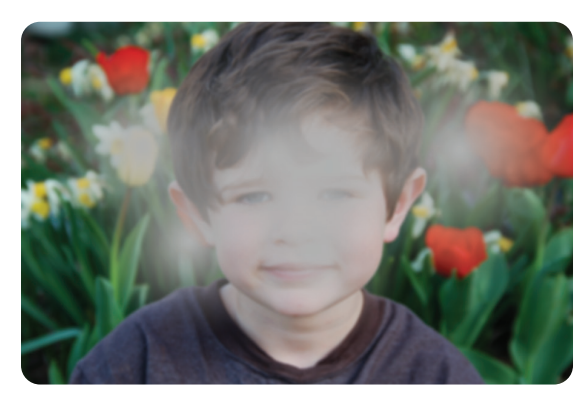
Blurry or dim vision

Cataracts can be removed only with surgery.