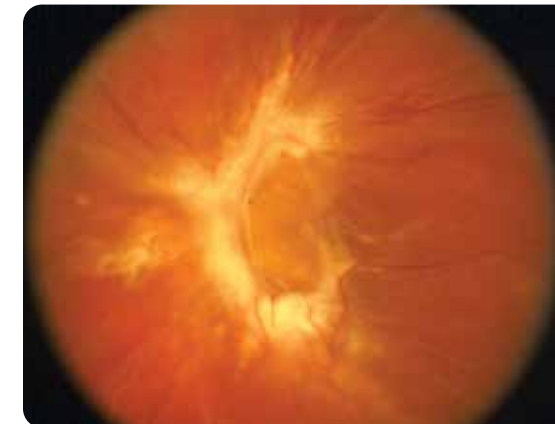
Retinal scarring and detachment

PDR is very serious, and can steal both your central and peripheral (side) vision.