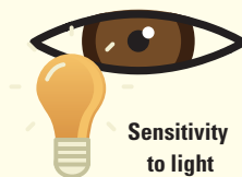
Sensitivity to light