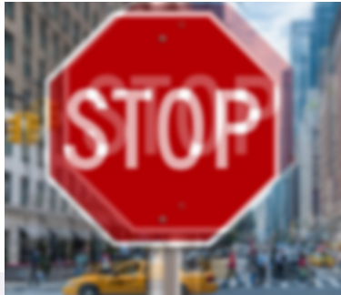
Double vision can be a symptom of Thyroid Eye Disease.

In more advanced thyroid eye disease, there may also be: